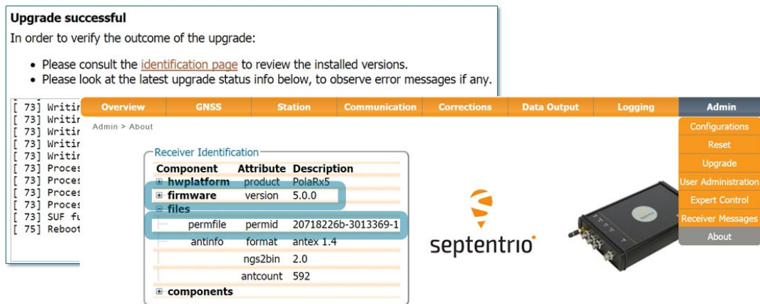
Figure 7-6: Checking the firmware and permission file versions

If there were no problems with the upgrade, the message 'Upgrade successful' will appear. You can then check on the Admin/About window, as shown in Figure 7-6, that the new firmware version or permission file has been updated.