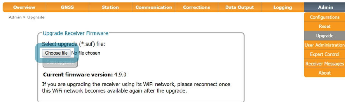
Figure 7-4: Selecting the .suf file to upload to the receiver

The upgrade procedure is started by clicking on the 'Choose file' button in the 'Upgrade' window of the 'Admin' menu and which is highlighted in Figure 7-4.